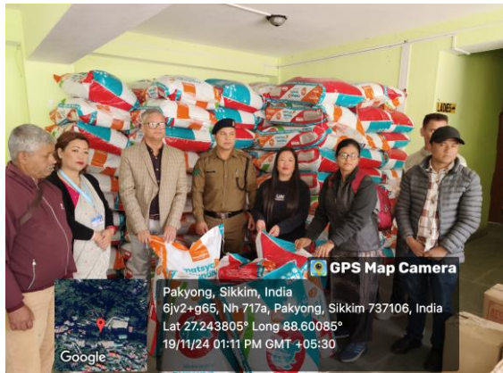
Fig. Distribution of fish feed to the farmers of Sikkim

The Hon'ble Minister encouraged farmers to adopt advanced aquaculture technologies to enhance productivity and sustainability. He also urged individuals having water resources to consider fish farming as a profitable and sustainable livelihood. He thanked Dr. P.K. Sahoo, Director, ICAR-CIFA, for the institute's efforts in promoting aquaculture in Sikkim.