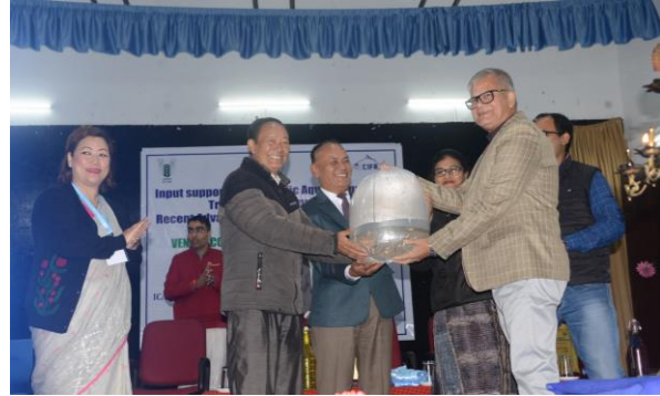
Fig. Distribution of Amur carp seed to the farmers of Sikkim in the presence of Shri Puran Kumar Gurung, Hon'ble Minister for Agriculture, Horticulture, Animal Husbandry, and Fisheries, Government of Sikkim.

Each farmer received 1,000 Amur carp seeds and 200 kg of floating fish feed. A total of 50,000 seeds and 10,000 kg of feed was distributed among the farmers.